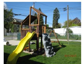
Blue Haven Kids Zone